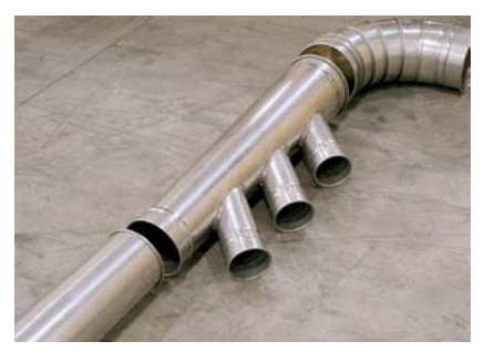
Lay your system out on the floor

STEP THREE: Preparing to Install Your Ducting. It is important for the installer to understand the layout the system designer planned for the ducting. Follow all local codes and regulations and note loading capabilities of structures to ensure the ducting is properly supported and that the building can carry the ducting system. If your installer doesn't understand the layout, he will not to have all the parts necessary to complete the job. If you do not have a clear understanding or drawing of the system you are about to install, please call the person who designed the system before you begin work.