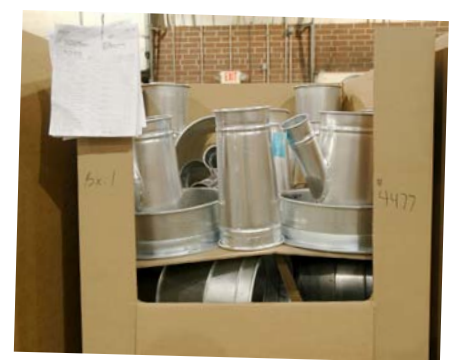
Make sure your parts match the packing list

If you have any problems, call your dealer as he is in the best position to rectify any problems with your particular order. Have all packing documentation with you when you call.