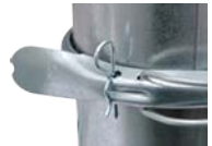
Use Cotter Pins

IMPORTANT SAFETY NOTE: On very rare occasions, unpinned clamps can spring open unexpectedly which can cause the pipe to drop. Additionally, the handles on unpinned clamps have been known to cause injury when they sprung open.