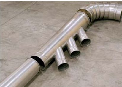
Lay your system out on the floor

STEP THREE: Preparing to Install Your Ducting. It is important for the installer to understand the layout the system designer planned for the ducting. Follow all local codes and regulations and note loading capabilities of structures to ensure the ducting is properly supported and that the building can carry the ducting system. If your installer doesn't understand the layout, he will not have all the parts necessary to complete the job. If you do not have a clear understanding or drawing of the system you are about to install, please call the person who designed the system before you begin work.