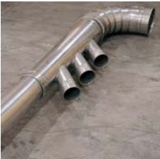
Clamp pieces on ground