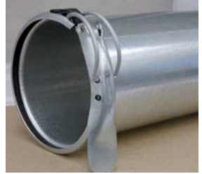
Pre-stretch your clamps

STEP SEVEN: Pre-Stretch Your Clamps. The Nordfab clamps are designed to provide a tight seal, which means that they also require some pressure to close. By pre-stretching the clamp around the rolled edge of a single piece of pipe, you can make it much easier to close when you connect two pieces together.