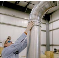
Lift pieces into place

The ducting must be properly supported. It is unsafe to have several segments cantilevered without support. Each additional piece of pipe puts enormous amounts of pressure on the clamps and hangers which could result in catastrophic clamp or hanger failure.