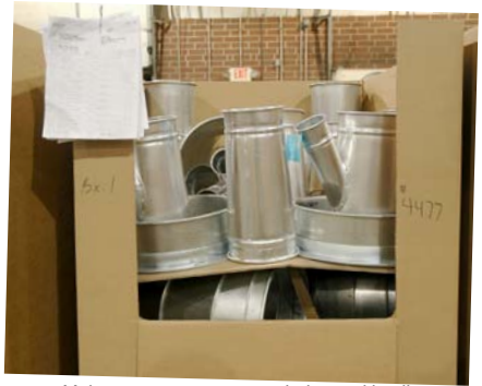
Make sure your parts match the packing list

If you have any problems, call your dealer as he is in the best position to rectify any problems with your particular order. Have all packing documentation with you when you call.