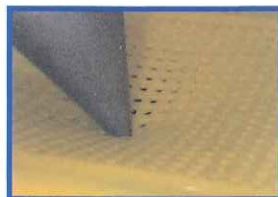
Exclusive RhinoFlex Thin Membrane Anti-blinding Screens